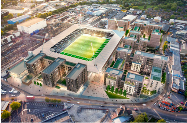
Left: The new £25m AFC Wimbledon stadium and 602 apartments under construction by Galliard Homes