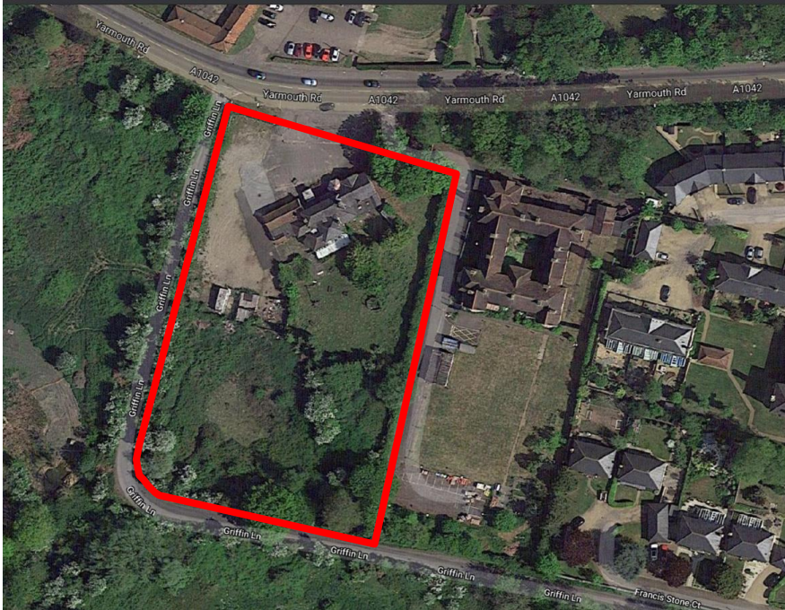
Site boundary shown for indicative purposes only