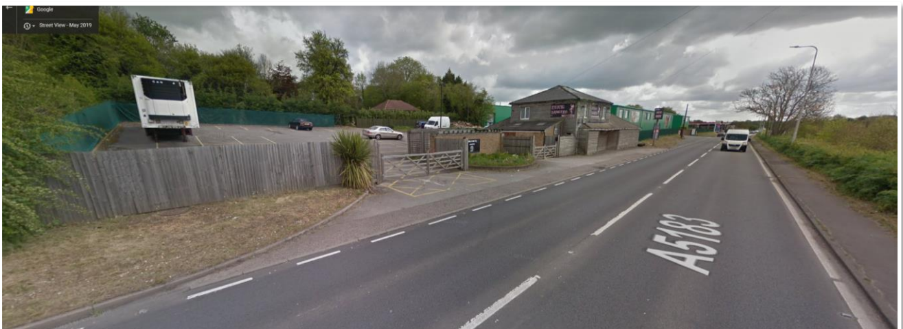
Maps & photos courtesy of Google