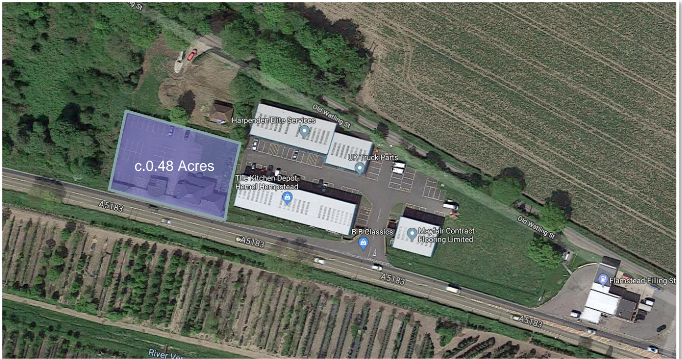
Site boundary shown for indicative purposes only